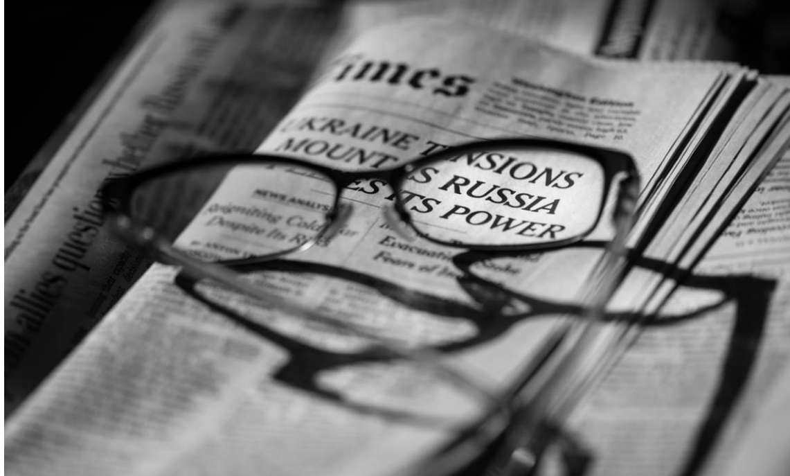
First Place: “Focus on Russia” By Gosia Klosek

To focus on a message through a reading glasses lens, I selected a small f-stop to have large portions of the image blurry. In addition, in post processing, I increased the exposure of the part of the image shown through the glasses' lens. I took a few pictures from different angles, showing larger and smaller areas of the newspaper text; I entered for the competition this image, with its direct line from the viewer to the area in focus. Nikon ISO 160 105mm f/3.5 1/100sec