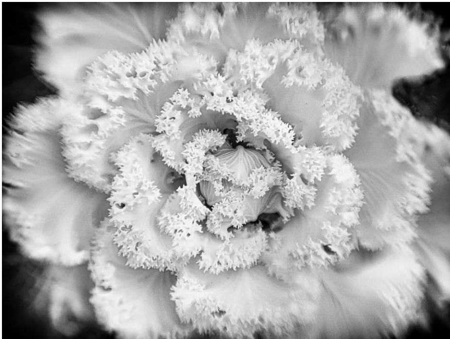
Second Place: “Ruffled Cabbage” By Coriolana Simon

To focus on a message through a reading glasses lens, I selected a small f-stop to have large portions of the image blurry. In addition, in post processing, I increased the exposure of the part of the image shown through the glasses' lens. I took a few pictures from different angles, showing larger and smaller areas of the newspaper text; I entered for the competition this image, with its direct line from the viewer to the area in focus. Nikon ISO 160 105mm f/3.5 1/100sec