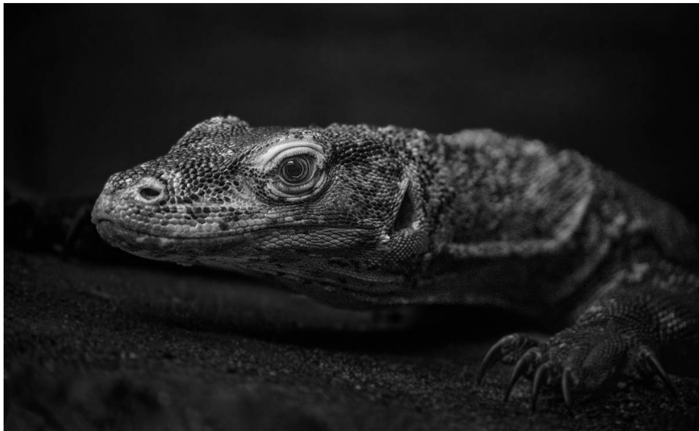
First Place: “Lizard” By Goutam Sen

The picture was taken at National Zoo, focused on the lizard’s eye. Setting was: f/6.3, 600mm, 1/1000 sec, ISO 12800.